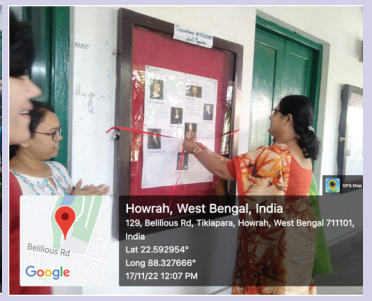
Inauguration of the wall magazine of Philosophy Department by IQAC Coordinator