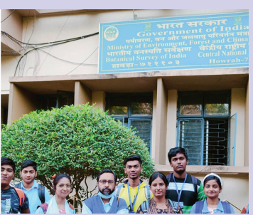
Field visit of Botany Honours students to Central National Herbarium on 23rd Dec 2022.