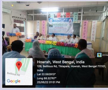
A session of the three days' National Conference organised by the Urdu Department during June, 2022.