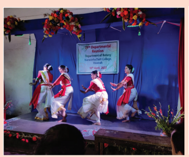
Dance program on the occasion of the 25th Reunion of the Department of Botany in early April, 2022.