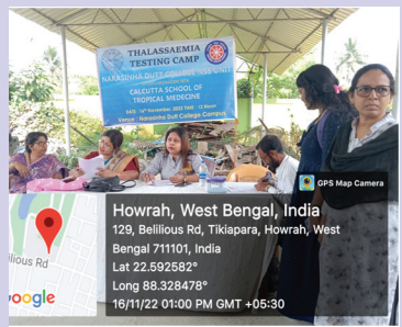
Thalassaemia testing camp on 16th Swachh Bharat Aviyan organised by Nov 2022, organised by the NSS Unit the NSS Unit of our college in 2022. of the College in collaboration with the Calcutta School of Tropical Medicine.