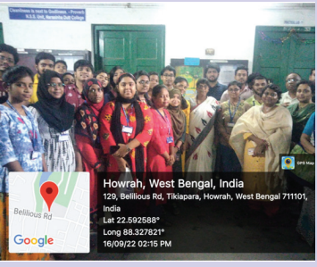
Faculty members and students of the Zoology Department with the Principal during the inauguration of the Wall Magazine of the Zoology Department.