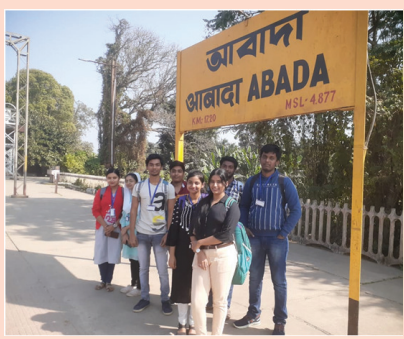
Field excursion of the Department of Botany to Abada.