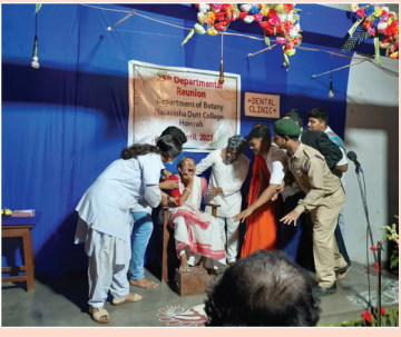
Cultural program on the occasion of the 25th Reunion of the Department of Botany.