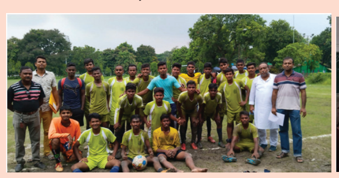
College Football Team.