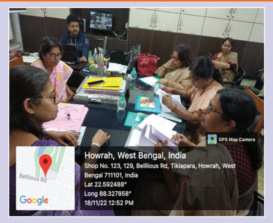
Ongoing Session of Academic Audit, 2022