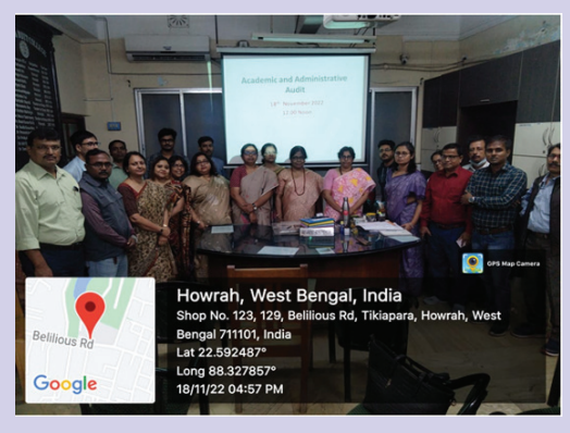
Academic Audit, November 2022, Group Photo.