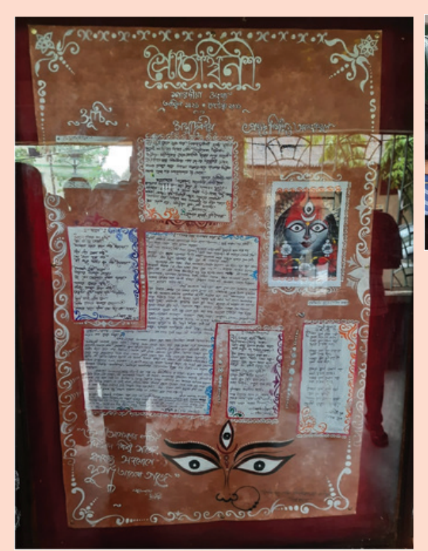
Wall magazine of the Department of Bengali, Srotoswini.