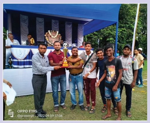
Achievement in Football Tournament