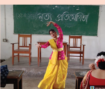
Cultural Competition held in late May, 2022