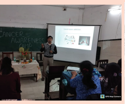
Lecture session during the cancer awareness programme organised by the Alumni Association of our college on 25th November, 2022